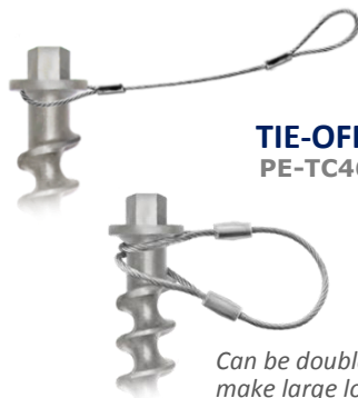
TIE-OFF CABLE PE-TC46

We will make custom brackets or sleeves to your specification